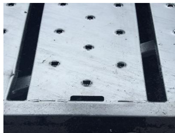
Steel floor panels have notches cut out to hook straps.