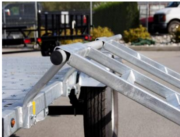
Ramps securely side load.