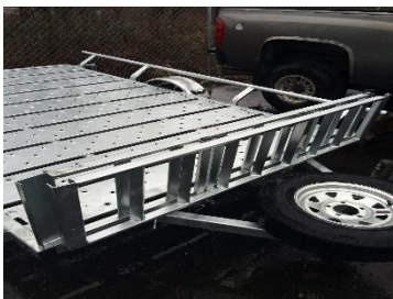
Both ramps can be stored on front allowing rear overhang.