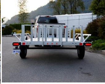
Ramps store in front & back of trailer.