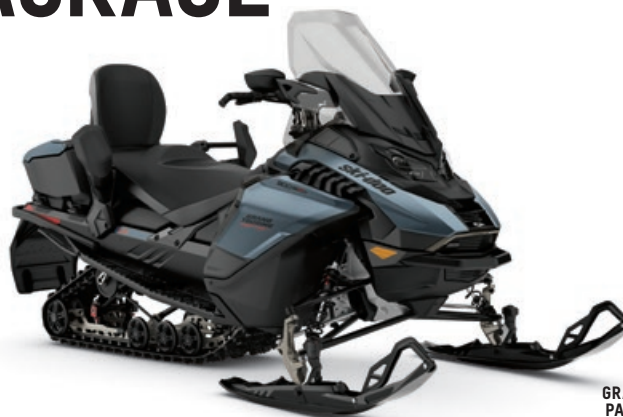
GRAND TOURING LE WITH PLATINUM PACKAGE 900 ACE TURBO R SHOWN