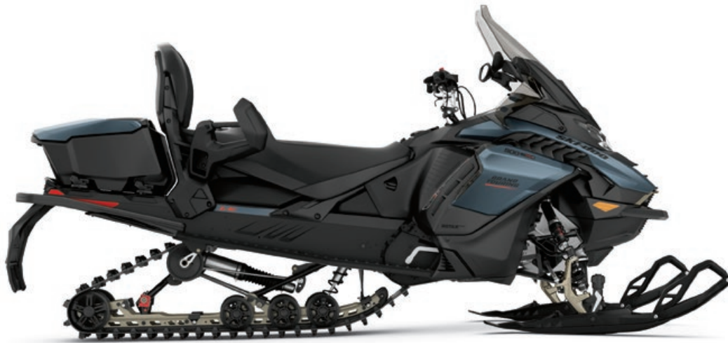
GRAND TOURING LE WITH PLATINUM PACKAGE 900 ACE TURBO R SHOWN

The Platinum Package includes a 10.25" touchscreen display featuring built-in GPS with Group Ride, premium LED headlights, studded 1.25" track, forward adjustable riser and Pilot™ TX adjustable skis.