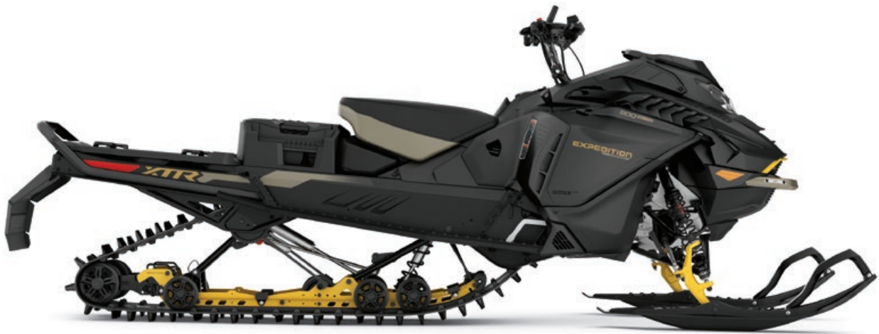
EXPEDITION XTREME 900 ACE TURBO R SHOWN

Incredible power and unmatched dynamic response with exclusive E-TEC direct-injection technology. Exceptional, proven durability and excellent fuel and oil economy.