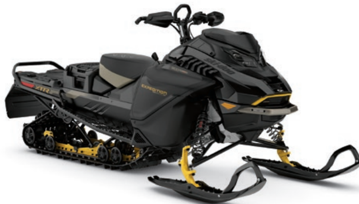
EXPEDITION XTREME 900 ACE TURBO R SHOWN

The high-performance widetrack crossover sled with the capability to go just about anywhere.