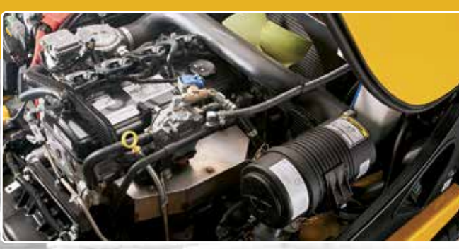
PSI 2.4L engine

The MX series includes adjustable modes to deliver an extra boost of performance to power through peaks or maximize fuel economy to control costs – whatever your application requires in real time. With Yale Flex Performance Technology, the PSI 2.4L engine generates 62 horsepower in the highest mode, providing exceptional acceleration and travel speed.