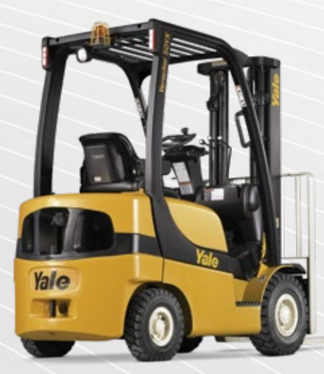
Truck shown with optional equipment