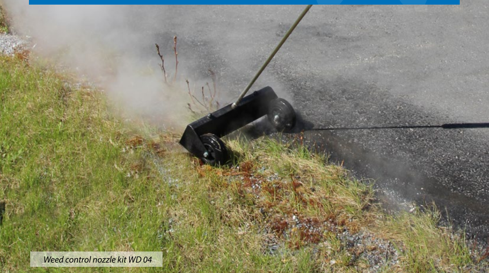
Weed control nozzle kit WD 04