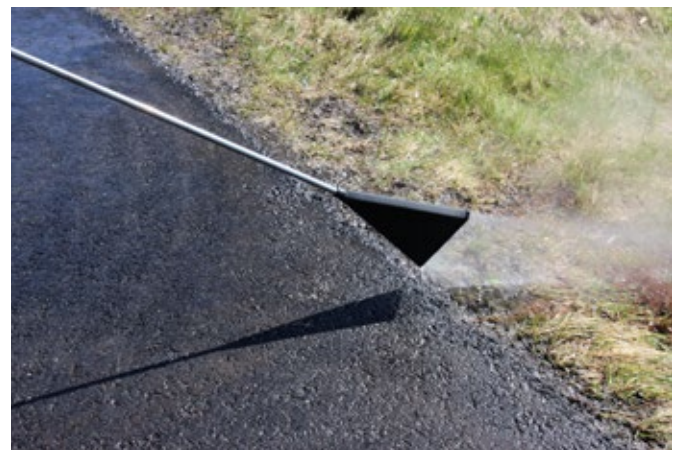
Optional weed control nozzle kit WD 01