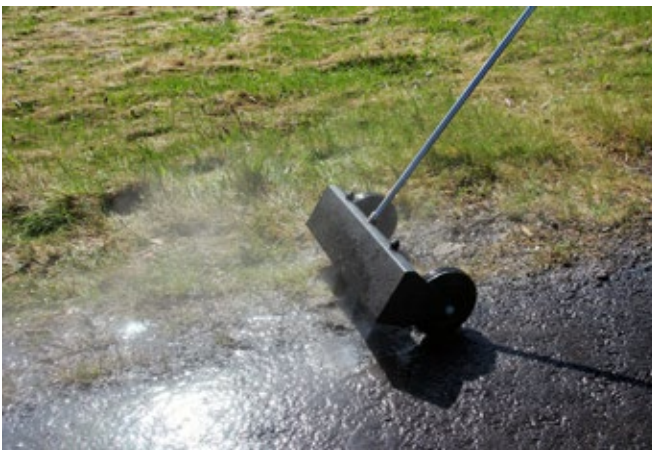
Optional weed control nozzle kit WD 04