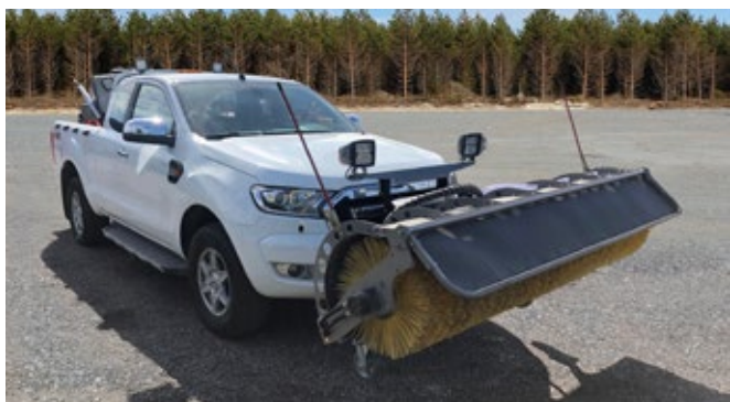
SweepAway™ rotary broom and Power Jet-It™ Combi 1000 l on pickup

The 20 meter hose-reel with an solid stainless-lance will allow you to be flexible and efficient in all situations.