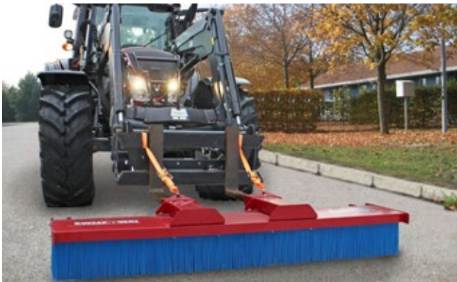
SweepAway™ medium series, with 12 brush rows