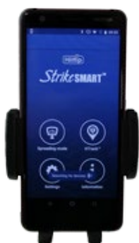
StrikeSmart™ Smart phone control