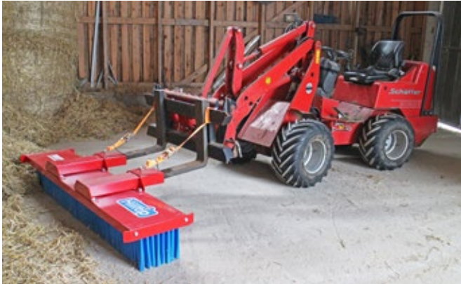
The SweepAway™ can handle a variety of materials, such as leaves, sand, rocks, debris, snow, slush etc.