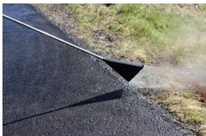
Weed control nozzle kit WD 01

The WeedStriker™ is equipped with a hot water boiler and a 12V pump that is controlled with StrikeSmart™ Smartphone App (Phone included) which also can be connected to the cloud based HTrack™ system .