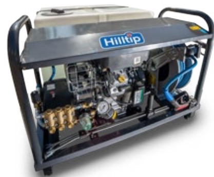
Jet-It™ cold water pressure washer

These versatile 350-1000 l mobile pressure washers are designed for use on pickups, trailers, tractors and other similar equipment. Their wide application areas enable easy washing/spraying of yards, graffiti, gardens, pavements, stairs, roofs, machines, facilities etc.