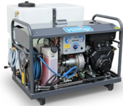
Jet-It™ HT2321H hot water pressure washer

With the optional weed control kits it's easy to get rid of weeds on walkways and cracks in driveways. Hot water kill weeds ecologically and the treated area is safe to use immediately after the treatment.