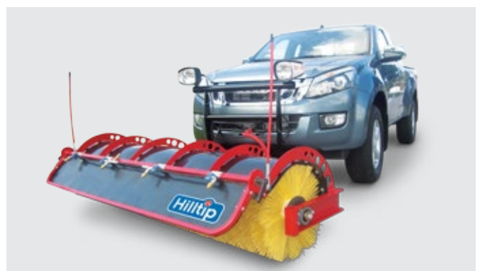
SweepAway™ rotary broom on pickup