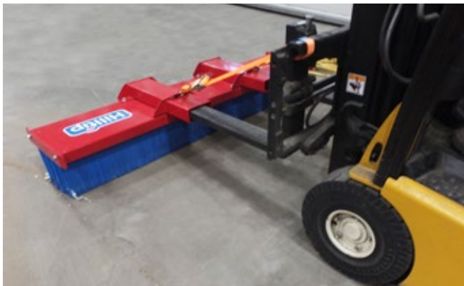
SweepAway™ with attachment for forklift