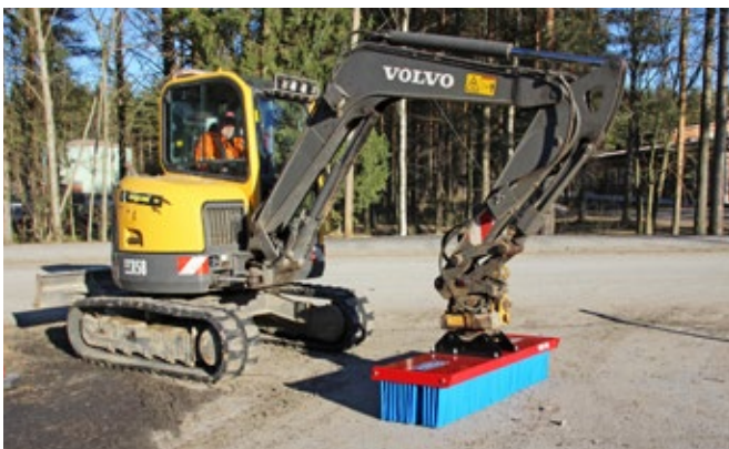
SweepAway™ on excavator