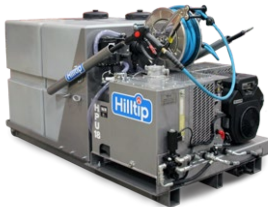
Power Jet-It™ Combi 1000 l

The Power Jet-It™ Combi is designed for installation onto pickups, flat beds, trailers and other similar vehicles. The Combi unit is available in two different watertank capacities, 500L and 1000L. The total length of the 500L model is only 135cm. This makes it fittable on even Double-Cab Pickups!