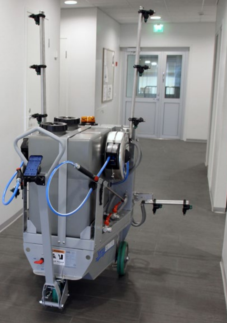
SprayStriker™ 130M sprayer

“WE HELP YOU KEEP SOCIETY CLEAN AND SAFE”