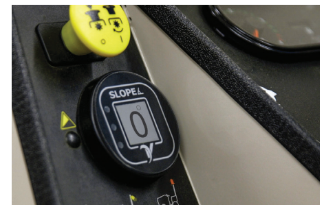
Digital Slope Gauge Recommended for operation on slopes.

*Attachments, accessories, and tire configuration may reduce the 4500 power unit's maximum angle of operation. Refer to applicable operator manuals for maximum angle of operation of equipment.