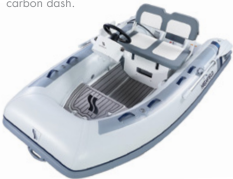
CLASSIC 310 with FCT-7

Designed to fit the CL 290 thru 380, the FCT-7 console is an all-in-one seating and steering approach, with built-in navigation lights and switches and new carbon dash.