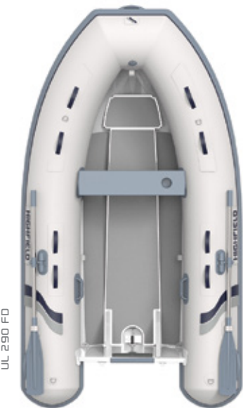
UL 250 FD