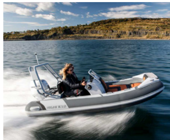
SPORT 390 with optional roll bar

Brushed EVA teak flooring, internal LED convenience lighting, recessed cleats & high quality upholstery set this range apart from the competition. Roll bars with mounted stern lights or rear tow posts and removable sun deck cushions available as options.