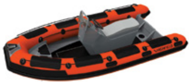
PATROL 460 w/jockey console

The PATROL series offers a range of customizable cockpit layouts, giving you a number of options for what kinds of seating and steering set-up you want, ideal for yacht club chase boats, expedition operators, or private owners looking for the ultimate in a big, powerful RIB.