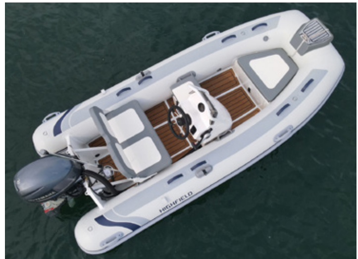
CLASSIC 360 with GT PACKAGE