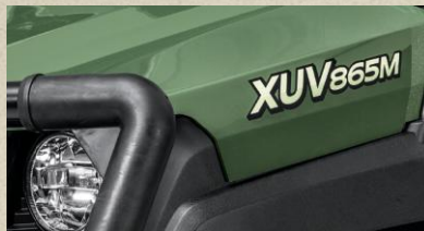
Olive & Black Available as an option on M and R Trim Full-Size XUV Models..