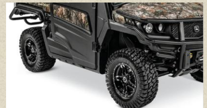
Premium Protection Package Upgrade your 3-passenger XUV with 360-degree protection. Front Brush Guard and Extensions, Rear Bumper, Rear Fender Guards and Rear Fender Flares. Help keep your vehicle looking like the day you brought it home