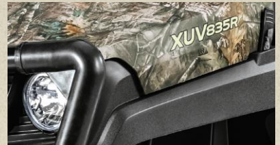
TrueTimber® Kanati® Available as an option on M and R Trim Full-Size XUV Models..