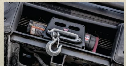
Warn® Winch The 3,500-lb (1587 kg) and 4,500-lb (2041 kg) winches pull their own weight and then some. Easily mount with the Winch Mount Kit and add a wireless remote control for additional convenience.