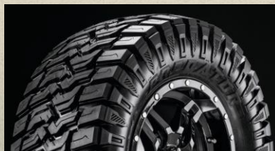
Predator Heavy-Duty all-terrain radial tires These heavy-duty all-terrain radials are specifically designed to a longer life on hard surfaces and intermediate off-road usage. Front: 27X9-R14, Rear: 27X11-R14