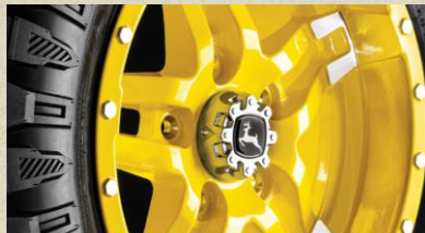
Yellow Alloy Wheel Trick out your ride and compliment the Green and Yellow machine color choice with optional yellow 14-in (35.5 cm) alloy wheels.