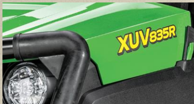
Green & Yellow Included in the base price on all Full-Size XUV models.