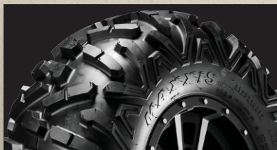
Maxxis Bighorn 2.0 extreme terrain radial tires Take on extreme terrain and laugh in the face of Mother Nature's toughest trails. Front: 27X9-R14, Rear: 27X11-R14