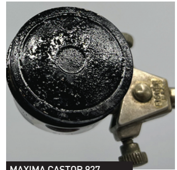
MAXIMA CASTOR 927