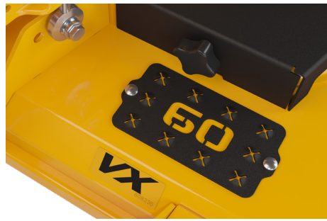
Fabricated Step Tread