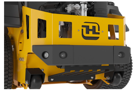
7 ga. Engine Guard