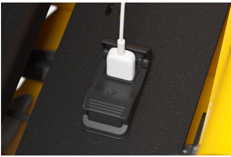
Dual USB Port