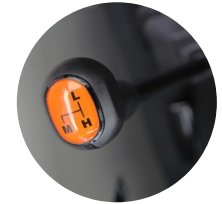
4. 3-range HST & 8F x 8R gear transmission