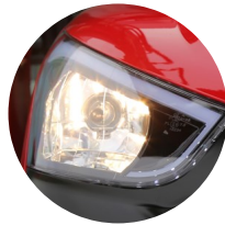
2. Projection headlights