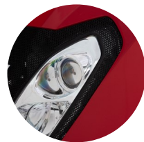
2. Projection head lamps