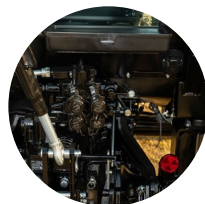
3. 2 sets of rear remote valve for various implements