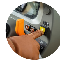
4. Independent rear PTO switch