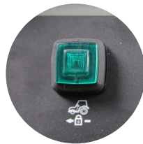
1. PTO cruise control

With more power in the same compact frame, the T454 redefines what a compact tractor can do. Make more impact without compromising on maneuverability.