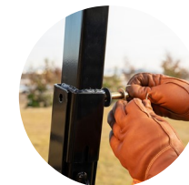
5. Foldable ROPS or all-season cab