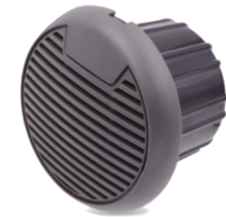
4. Bluetooth speaker with IP66 grade waterproofing