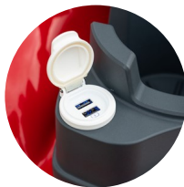
3. USB 2 port