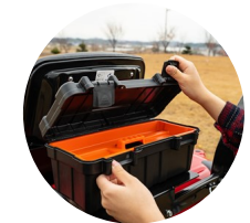
6. Wide loadspace with a well-equipped toolbox