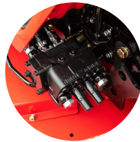
2. 3rd function for 4-in-1 bucket work