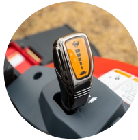
1. 2 range hydrostatic transmission (HST)

Get work done quicker with this small-frame tractor. Highly maneuverable and with maximized lift capabilities, the T25 is designed to be an all-round multi-tasking machine.