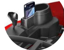
5. Wireless smartphone charger