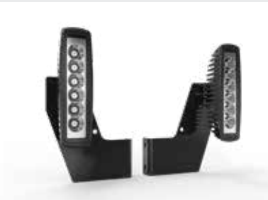
L.E.D. HEADLIGHT KIT