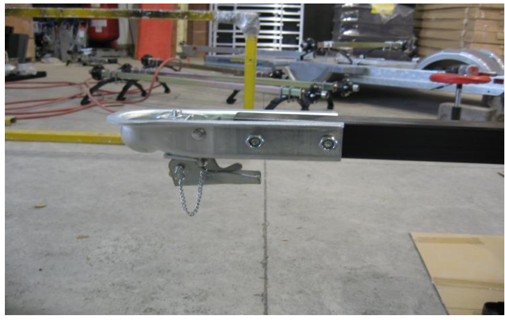
8. Remove caps from center of the hub lightly grease the zirks on the back of the hub untill you see grease in the front of the hub