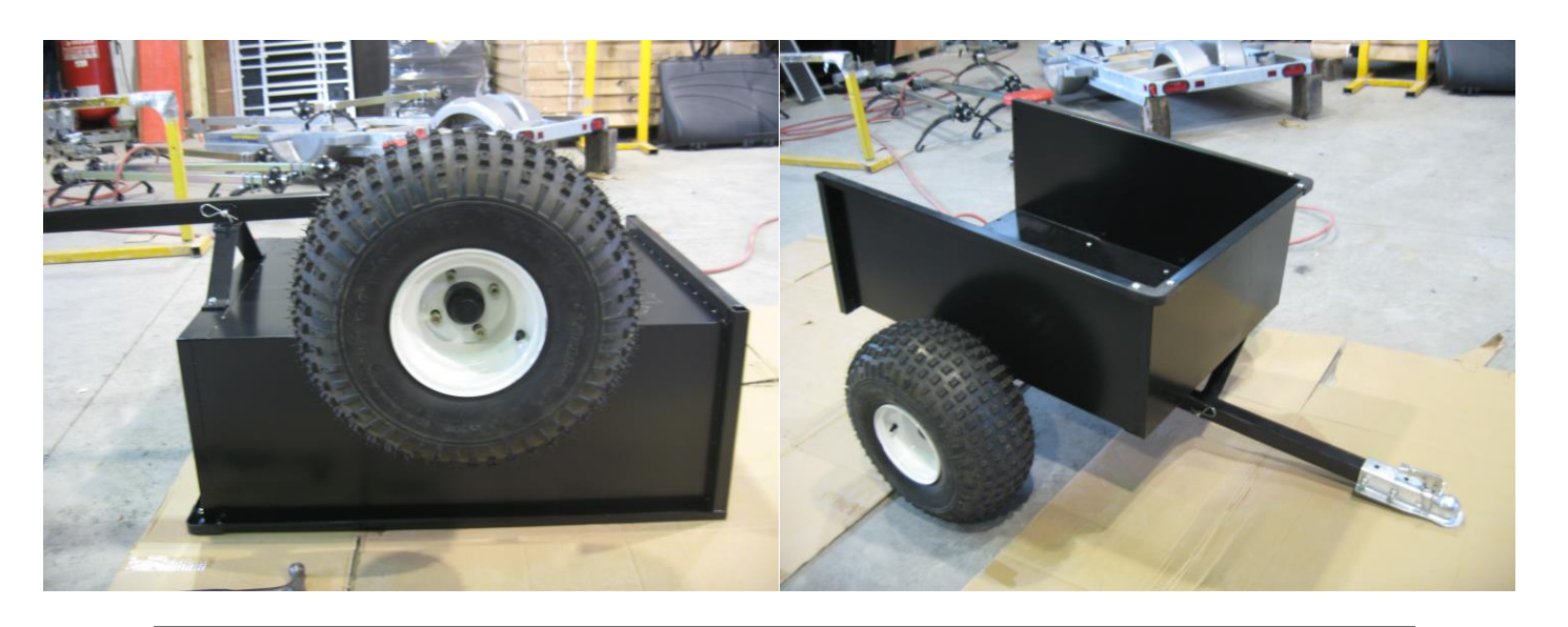
12. Then put your tailgate back in your trailer and your Marlon ATV 700 trailer is done ready to roll.

11. Place wheels over hubs and tighten lug nuts torque to 80 ft.lbs. Then with two people flip trailer over.