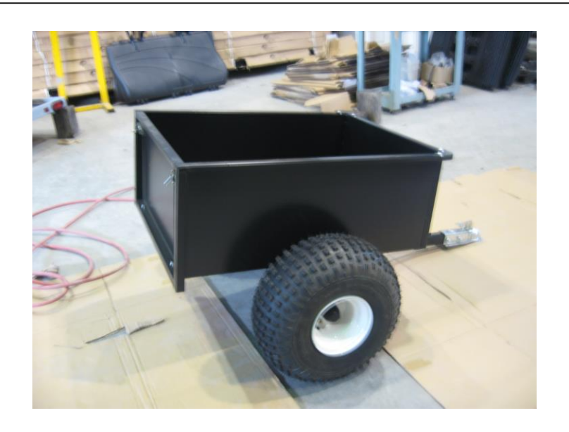
**Make sure to read all of owner's manual before using your Marlon AMT Trailer.