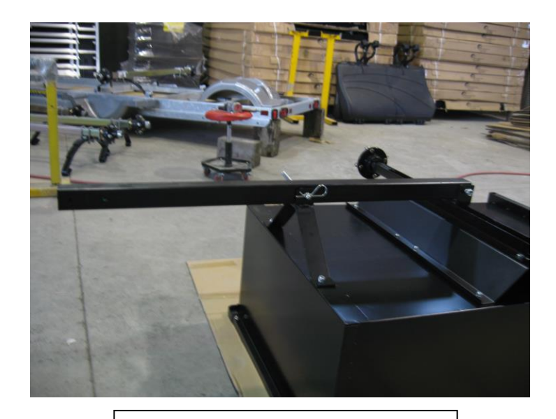
7. Attach coupler to the end of the tongue using two bolts.