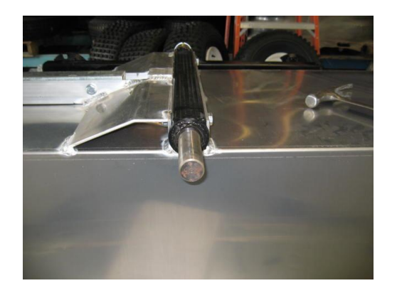
Turnover and reinstall.