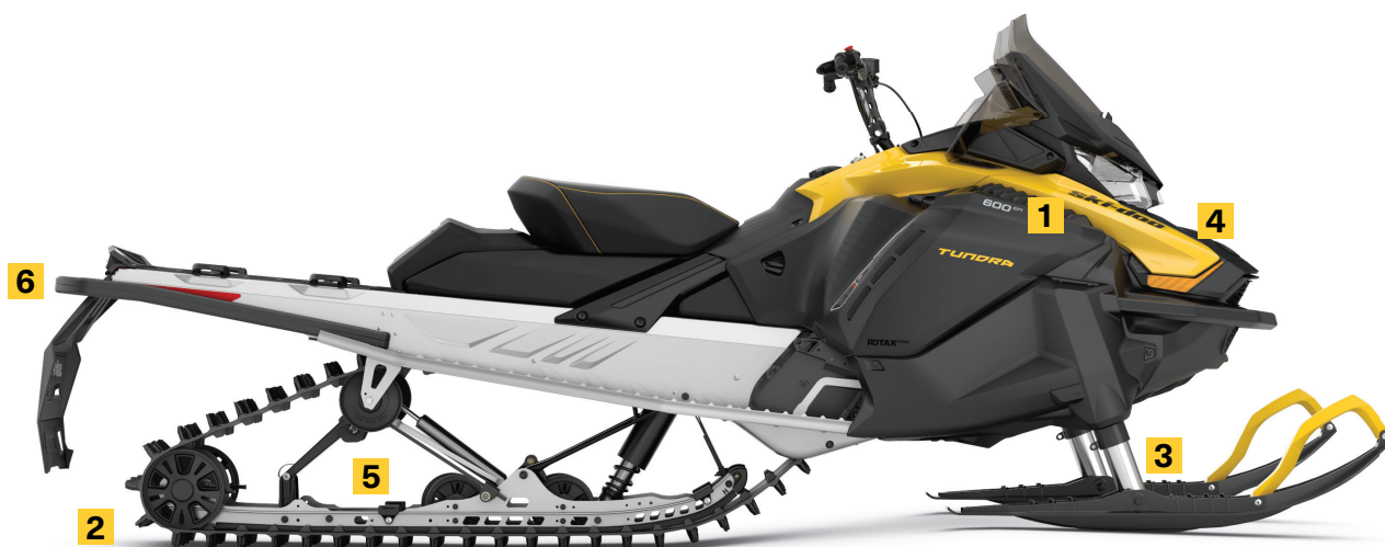
TUNDRA SPORT 600 EFI SHOWN

Industry-exclusive telescopic front suspension enables a large, flat belly pan for exceptional deep snow flotation.