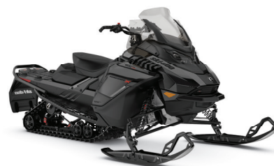
RENEGADE X 900 ACE TURBO SHOWN

High-performance and high-tech features for the most demanding rider.