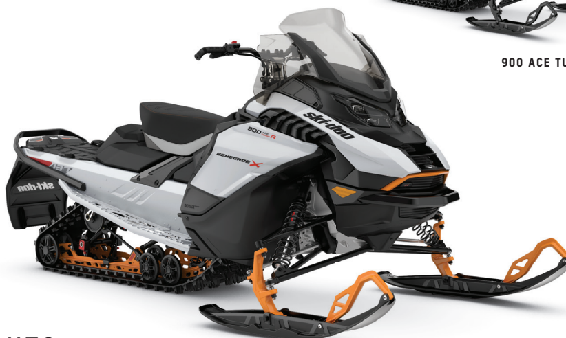
RENEGADE X 900 ACE TURBO R SHOWN