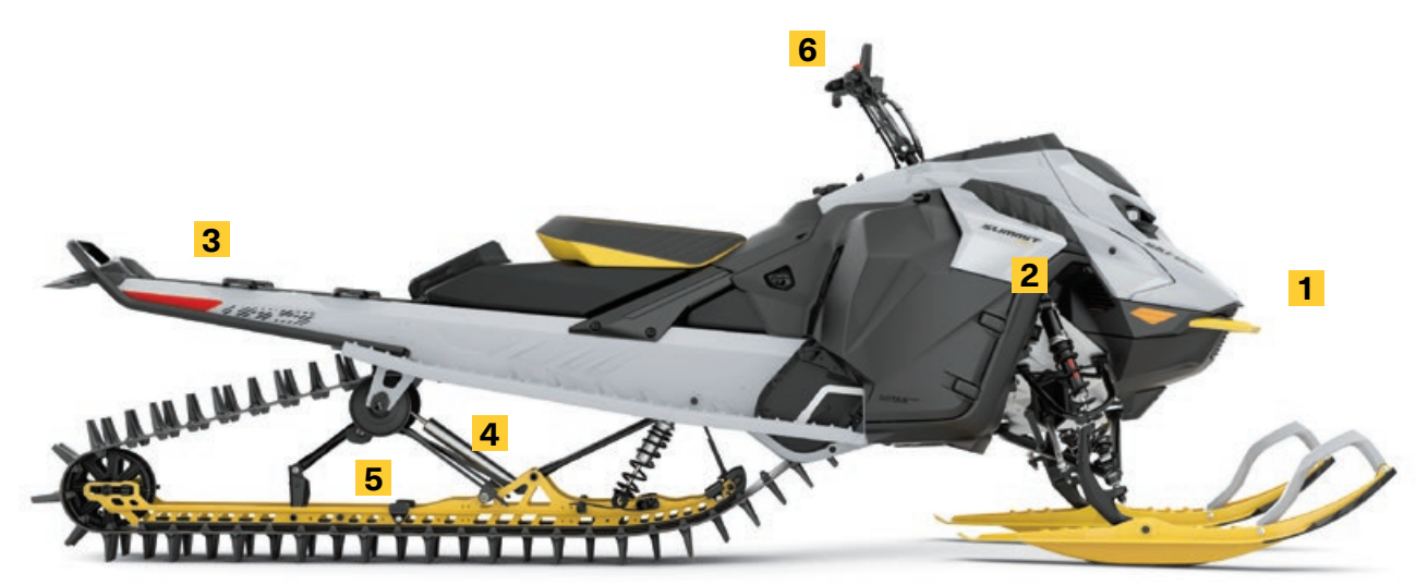
SUMMIT EDGE 165 850 E-TEC SHOWN

Shorter tunnel length without snowflap for greater deep-snow capabilities with more clearance and lighter overall weight. Standard rear fender with LinQ-ready attachment points.