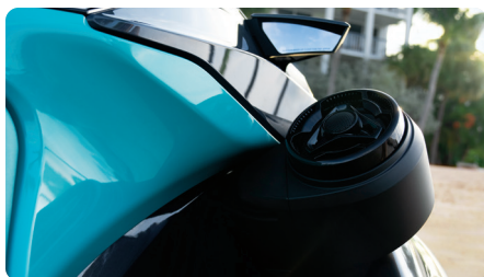
BRP Audio – Premium System (optional) The industry's first manufacturer-installed truly waterproof Bluetooth+ audio system.