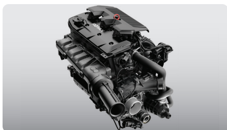
Rotax® 1630 ACE™ – 230 Engine This powerful engine comes standard with a supercharger and external intercooler. It is optimized to run on regular fuel, which lowers fuel costs. 1