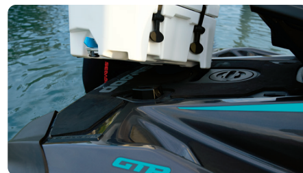
Swim Platform with Integrated LinQ System Exclusive quick-attach system on a large swim platform that allows for easy installation of storage accessories.