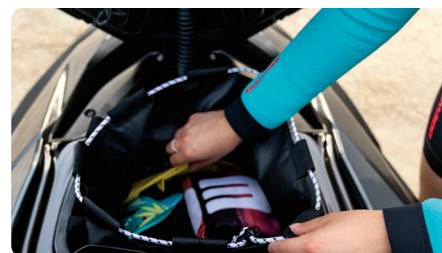
Large Front Storage An impressive 40 gallons of sealed storage space allows riders to safely stow belongings while riding.