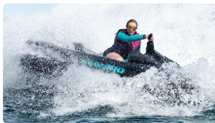
VTS™ (Variable Trim System) Provides handlebar-activated settings so riders can easily find the ideal trim for varying conditions.