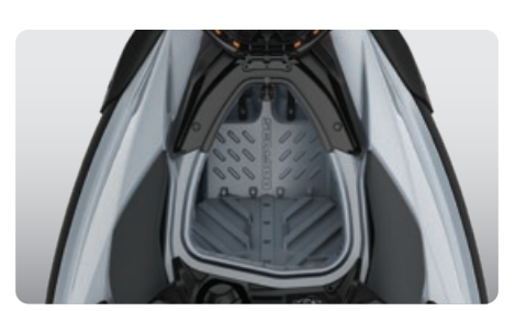
Large Front Storage

A deep-V design that offers unrivaled handling and acceleration and a new level of control at high speed.