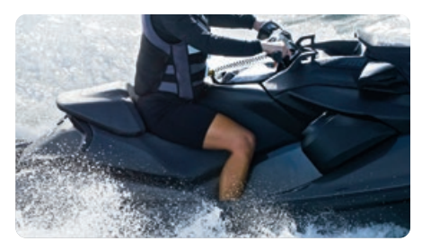
Ergolock™ R System

A narrow seat profile with deep knee pockets and a revolutionary adjustable saddle that allows riders to lock in to the machine like never before.