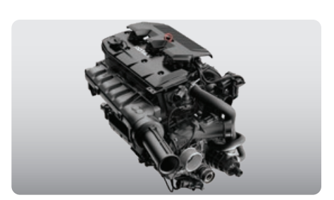
Rotax® 1630 ACE™ - 300 Engine

Full-color display with incredible visibility and a new level of functionality. Bluetooth and smartphone app integration provides music, weather, navigation and more.