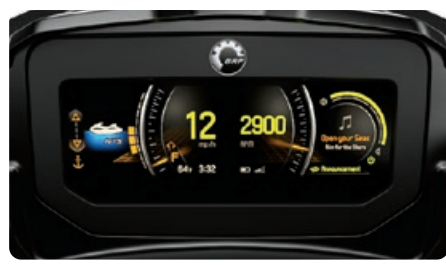
Full-Color 7.8" Wide Display (Optional)

The industry's first manufacturer-installed truly waterproof Bluetooth† audio system.