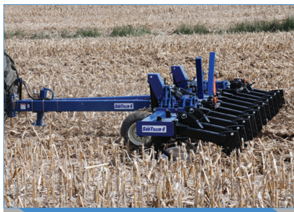
PULL-TYPE SUBTILLER 4