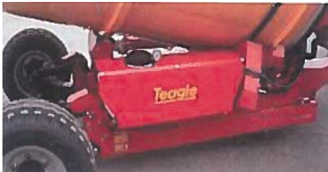
Dust Suppression Spray Kit