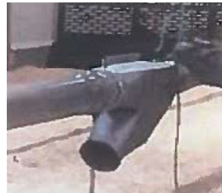
Asymmetric Diverter Valve