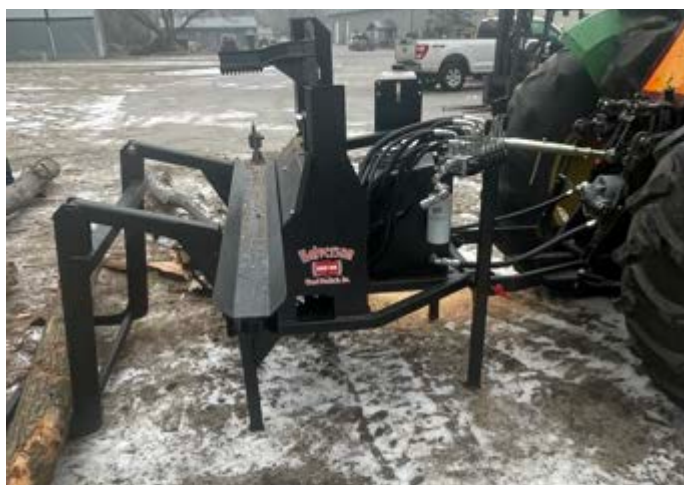
Optional Hydraulic Pump Specs