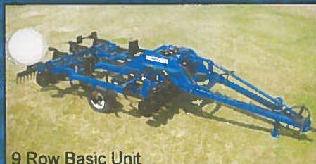
9 Row Basic Unit