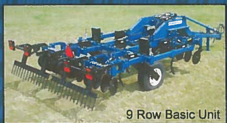
9 Row Basic Unit