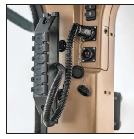
MOUNTING POWER STRIP

Install a convenient power source to the interior of your tractor cab. Lets you plug in displays, monitors and other electronic devices.