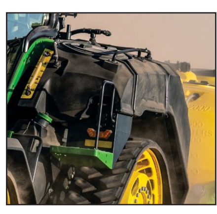
EXACTRATE<sup>™</sup> TRACTOR TANK KIT

BXX10912: 3657-mm (144-in.) spacing, rear axle kit.