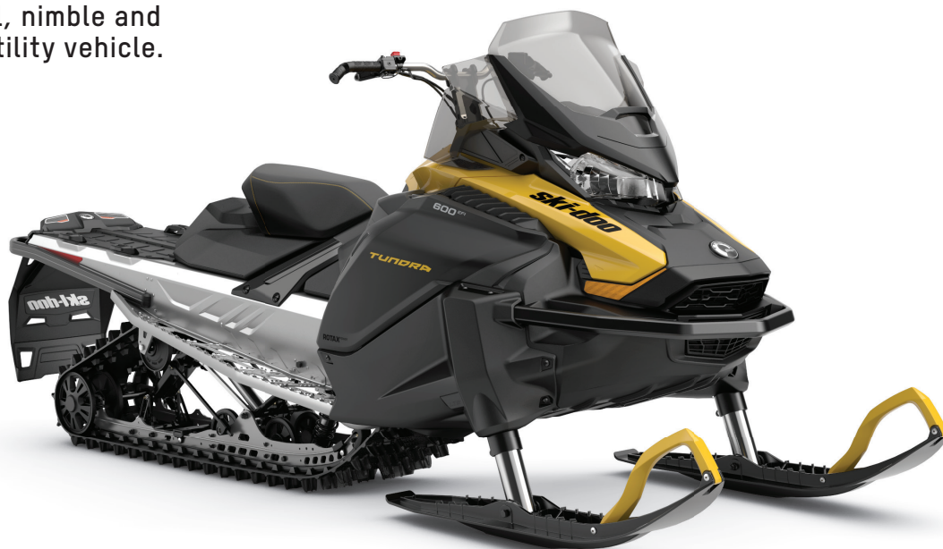
TUNDRA SPORT 600 EFI SHOWN

Economical, nimble and fun light-utility vehicle.