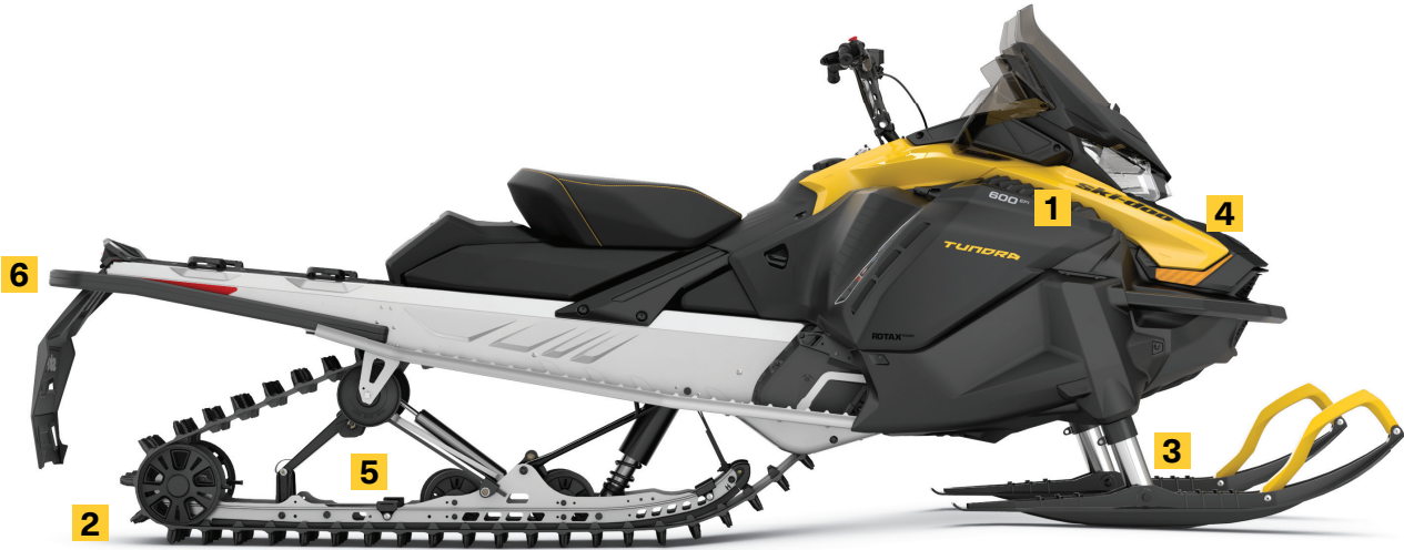
TUNDRA SPORT 600 EFI SHOWN

Industry-exclusive telescopic front suspension enables a large, flat belly pan for exceptional deep snow flotation.