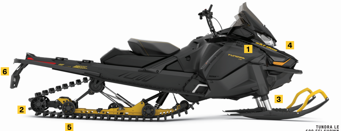
TUNDRA LE 600 EFI SHOWN

Industry-exclusive telescopic front suspension enables a large, flat belly pan for exceptional deep snow flotation.