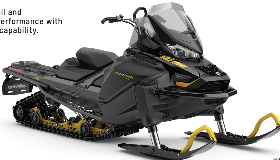
TUNDRA LE 600 EFI SHOWN

Great off-trail and deep snow performance with light-utility capability.