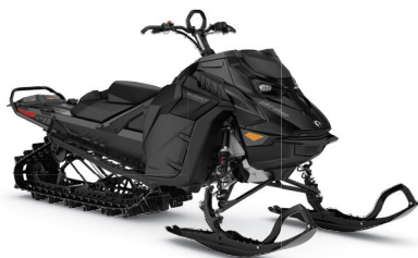
SUMMIT ADRENALINE WITH EDGE PACKAGE 146 850 E-TEC SHOWN

This high-end in-season package is loaded with proven technical features.