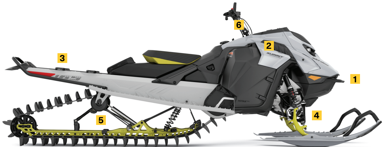
SUMMIT ADRENALINE WITH EDGE PACKAGE 165 850 E-TEC SHOWN

Shorter tunnel length without snowflap for greater deep snow capabilities with more clearance and lighter overall weight. Standard rear fender with LinQ-ready attachment points.