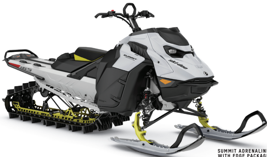
SUMMIT ADRENALINE WITH EDGE PACKAGE 165 850 E-TEC SHOWN