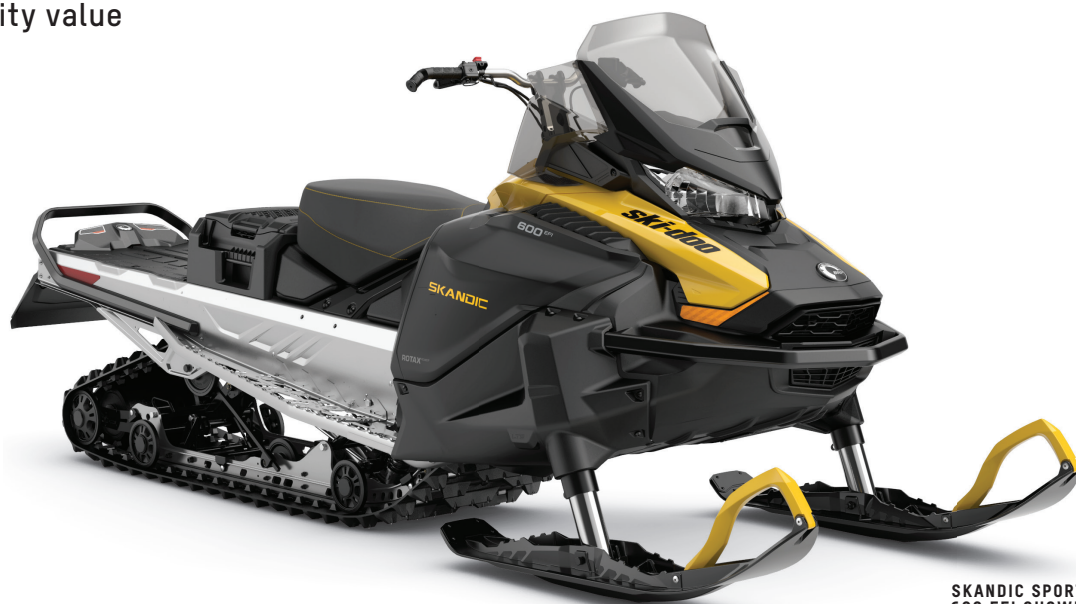
SKANDIC SPORT 600 EFI SHOWN

The best 20 in. utility value in snowmobiling.