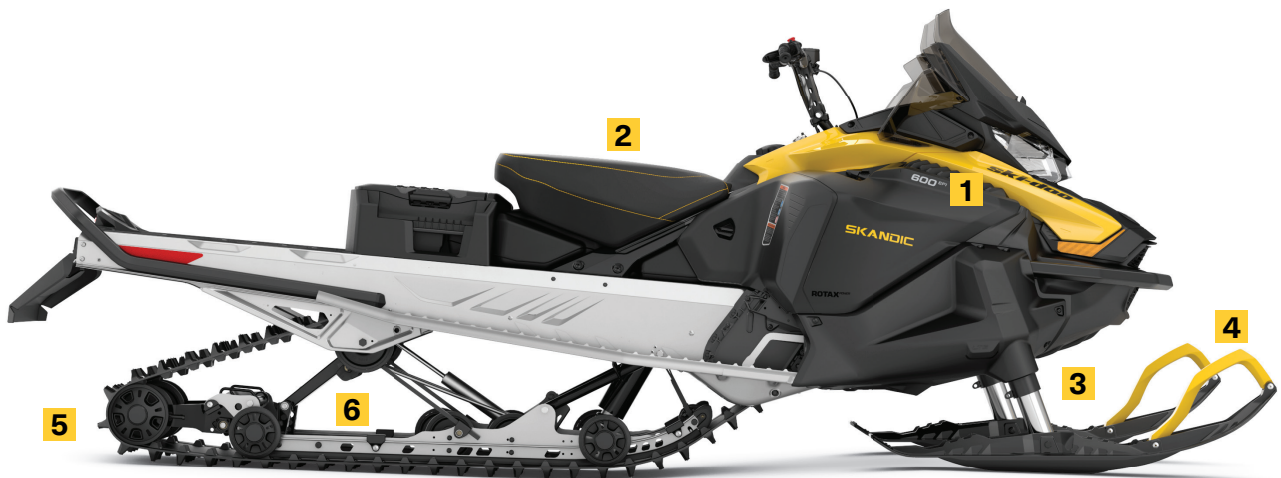
SKANDIC SPORT 600 EFI SHOWN

Industry-exclusive telescopic front suspension enables a large, flat belly pan for exceptional deep snow flotation.