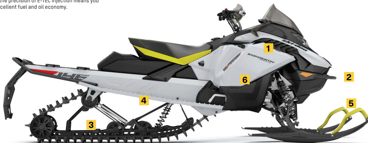
BACKCOUNTRY ADRENALINE 146 850 E-TEC SHOWN

Completely new lighter design is better balanced for performance on- and off-trail. Perfectly balanced weight transfer for an increased fun factor and more travel for more comfort and bump absorption.