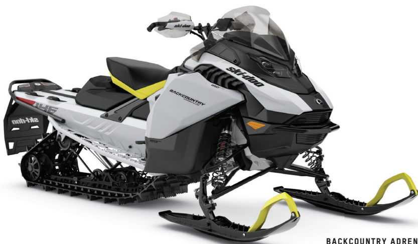
BACKCOUNTRY ADRENALINE 146 850 E-TEC SHOWN