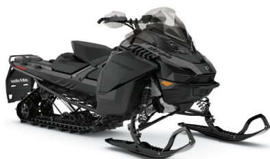
BACKCOUNTRY ADRENALINE 600R E-TEC SHOWN

Loaded with crossover-specific features for spending equal time riding on- or off-trail.