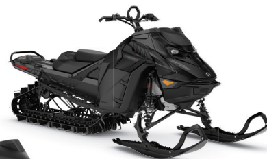
SUMMIT X 154 850 E-TEC SHOWN

Effortless throughout the day, the Summit X is the lightest, most agile and nimble of its family with an unmatched degree of playfulness.