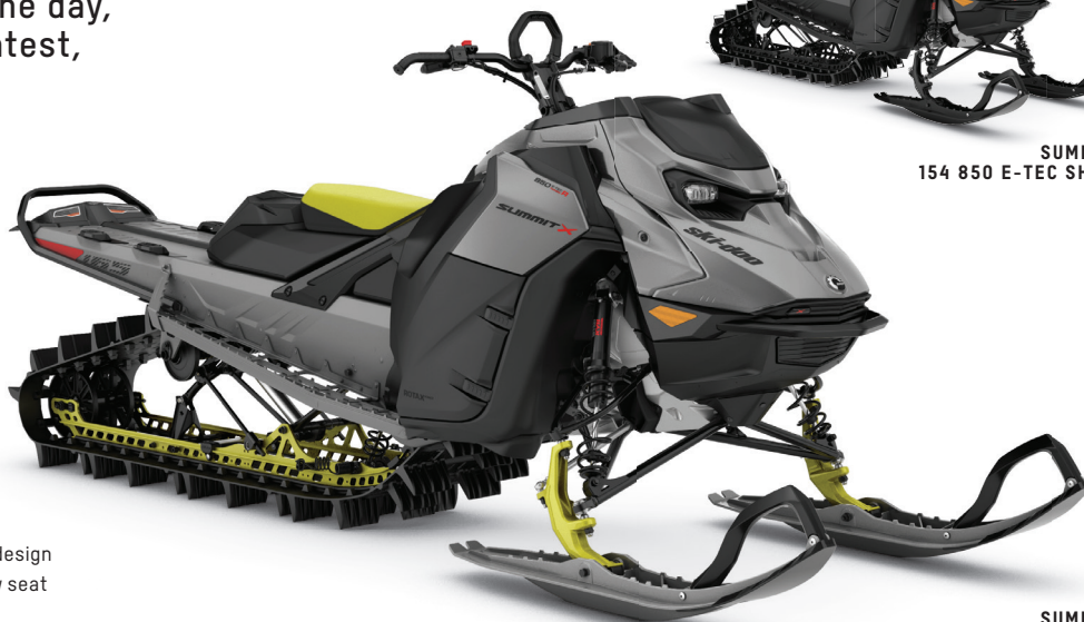
SUMMIT X 165 850 E-TEC TURBO R SHOWN