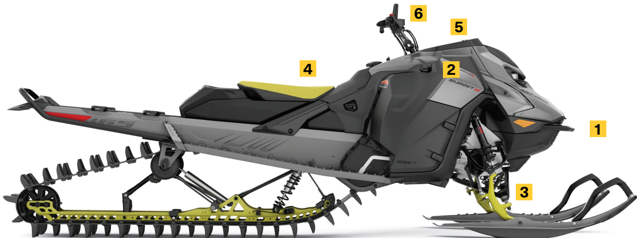
SUMMIT X 165 850 E-TEC TURBO R SHOWN

Highest-quality KYB high pressure gas front shocks with an updated lighter weight design. Rebuildable and revalvable.