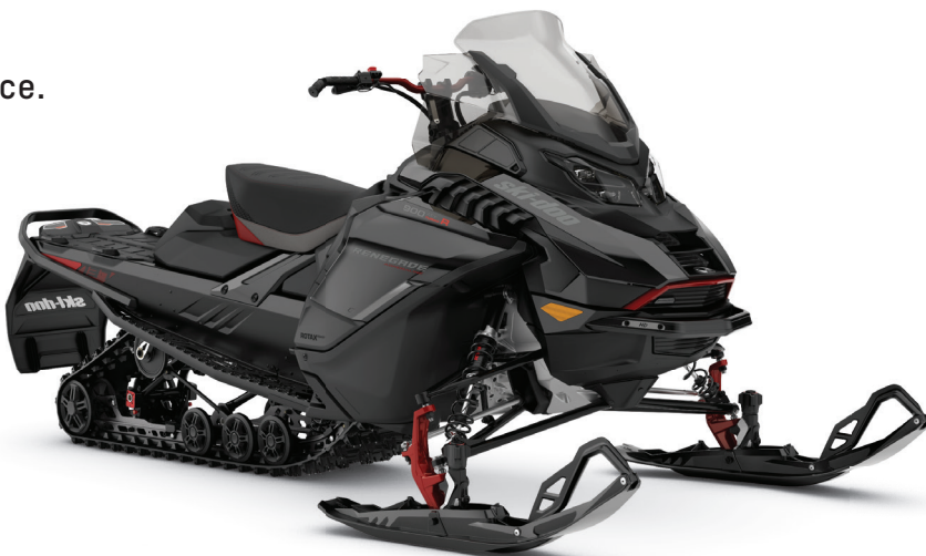
RENEGADE ADRENALINE WITH ENDURO PACKAGE 900 ACE TURBO R SHOWN

Adventure-ready with top-tier technology, comfort and performance.