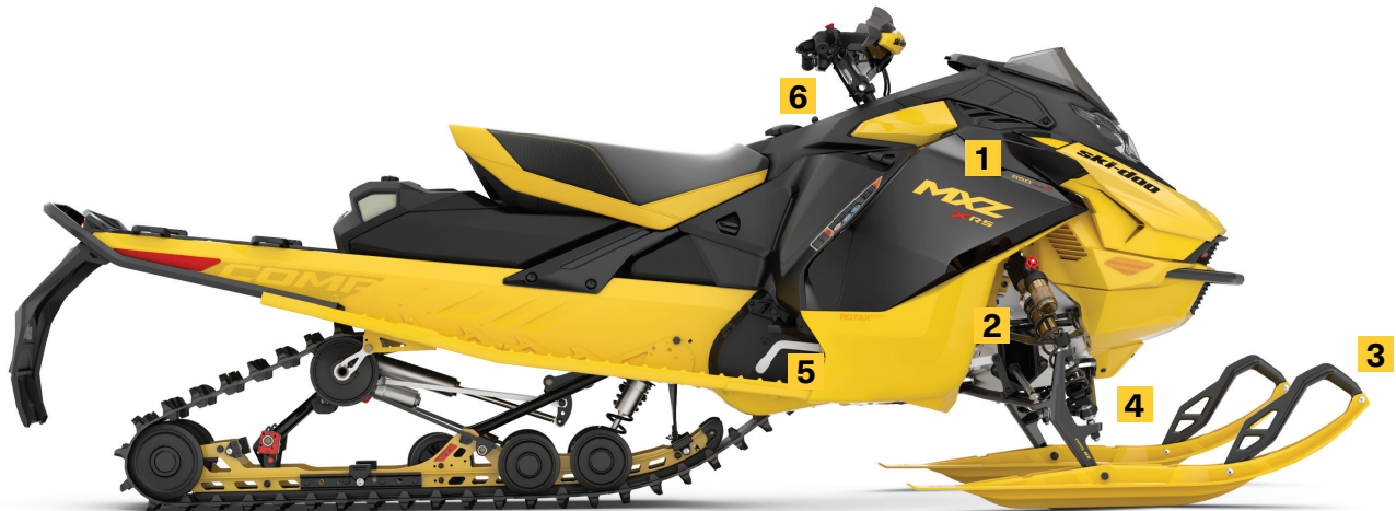
MXZ X-RS 850 E-TEC TURBO R WITH COMPETITION PACKAGE SHOWN

The aggressive design of the Pilot RX ski offers better grip, enhanced cornering, and unparalleled control in all snow conditions.