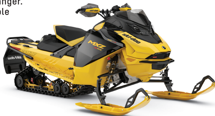
MXZ X-RS 850 E-TEC TURBO R WITH COMPETITION PACKAGE SHOWN