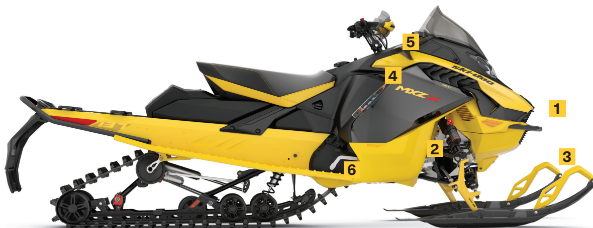
MXZ X 850 E-TEC SHOWN

The aggressive design of the Pilot RX ski offers better grip, enhanced cornering, and unparalleled control in all snow conditions.