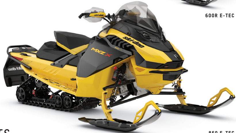
MXZ X 850 E-TEC SHOWN