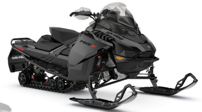
MXZ X 600R E-TEC SHOWN

High-performance with race-ready features for the most demanding rider.