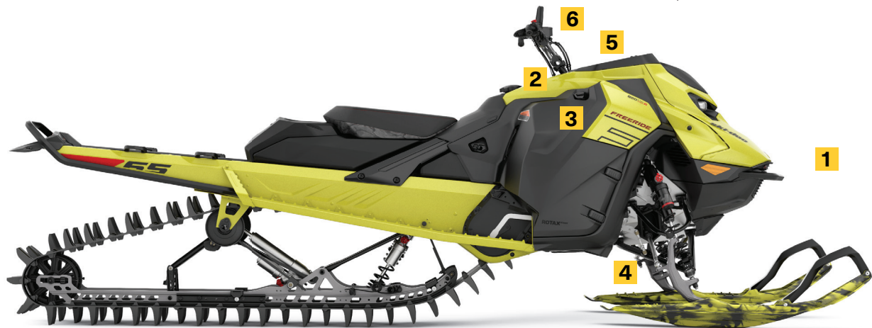
FREERIDE 165 850 E-TEC TURBO R SHOWN

The most powerful factory-built 2-stroke turbocharged engine in snowmobiling. Its instant response cranks out a full 180 HP up to 8,000 feet of elevation. Sophisticated design keeps weight down and integrates flawlessly with the REV Gen5 chassis for maximum agility. Factory install ensures peace of mind and incredible reliability.