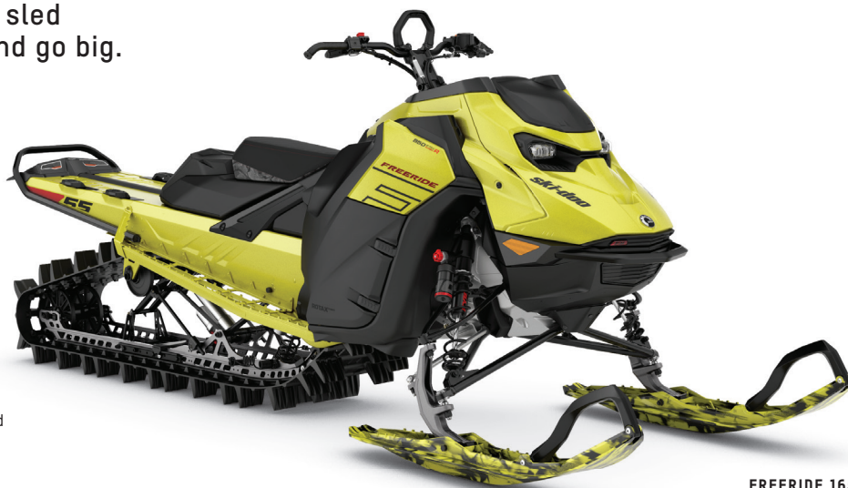
FREERIDE 165 850 E-TEC TURBO R SHOWN

Extreme capacity deep snow sled built to live large, live free and go big. The Freeride is stable and predictable at higher speed in variable snow conditions, including bigger bumps.