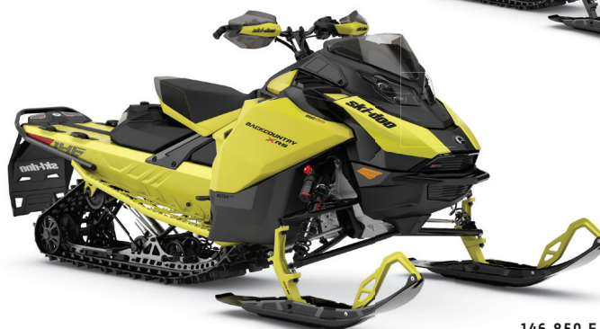
BACKCOUNTRY X-RS 146 850 E-TEC TURBO R SHOWN