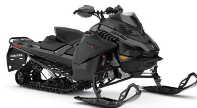
BACKCOUNTRY X-RS 146 850 E-TEC SHOWN

The most aggressive crossover vehicle with snocross attitude and go-anywhere capability.