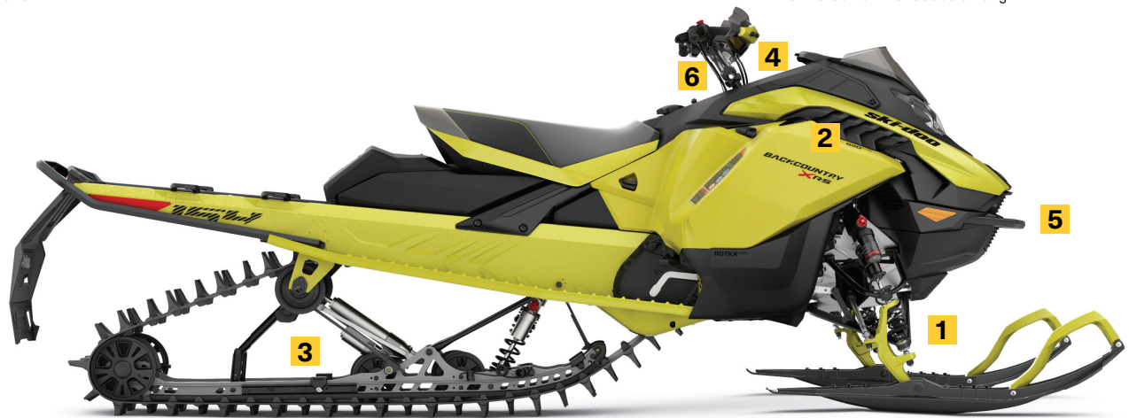
BACKCOUNTRY X-RS 154 850 E-TEC SHOWN

Completely new lighter design is better balanced for performance on- and off-trail. Perfectly balanced weight transfer for an increased fun factor, more travel for more comfort and rail reinforcement for added strength.