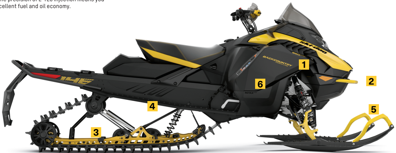
BACKCOUNTRY ADRENALINE 146 850 E-TEC SHOWN

Completely new lighter design is better balanced for performance on- and off-trail. Perfectly balanced weight transfer for an increased fun factor and more travel for more comfort and bump absorption.