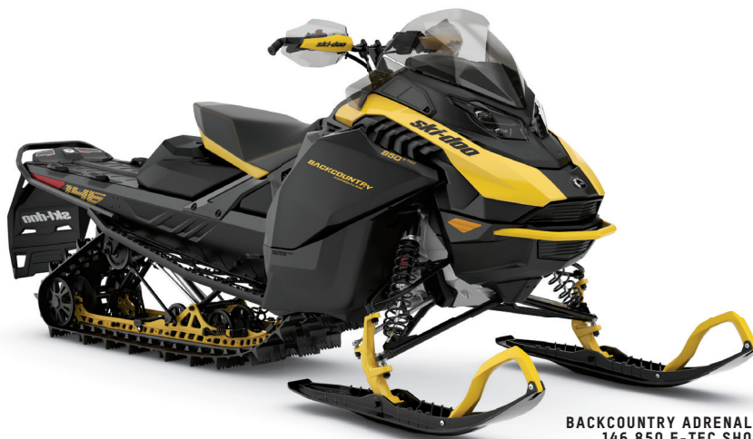
BACKCOUNTRY ADRENALINE 146 850 E-TEC SHOWN