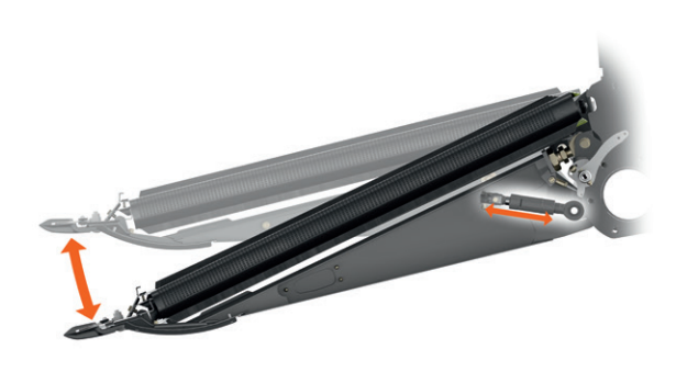
AUTO FLEX optimizes cutterbar pressure based on ground conditions