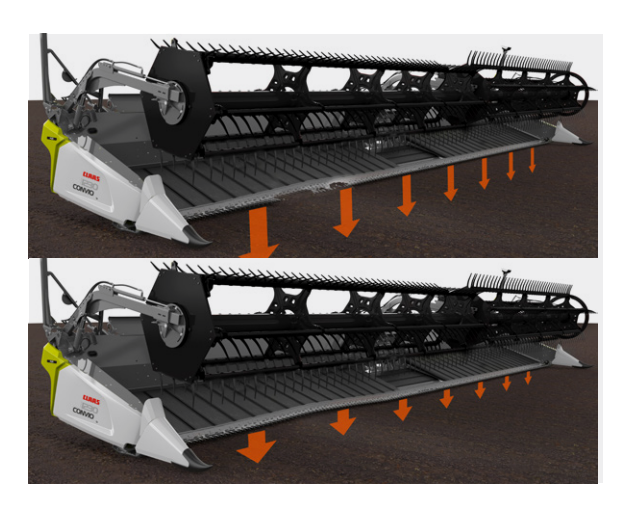
ACTIVE FLOAT allows ground pressure to be adjusted for the cab