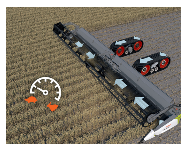
AUTOMATIC BELT SPEED matches belt speed to combine speed