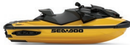
● Millennium Yellow