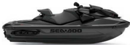
● Premium Triple Black