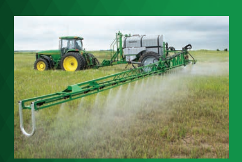
Sprayers & Applicators