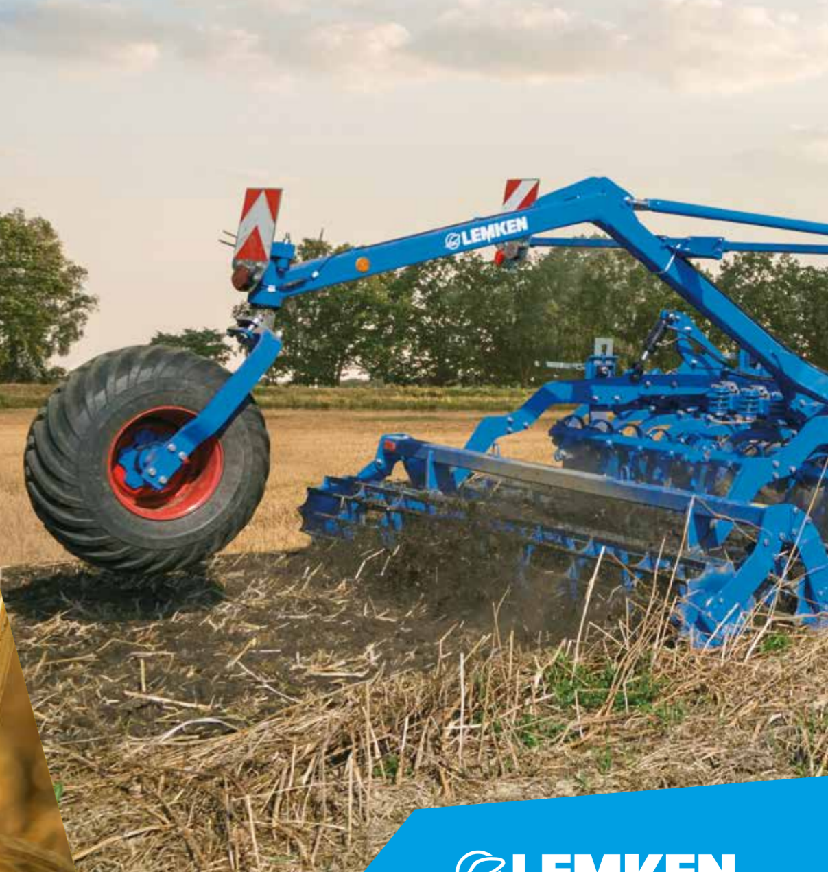
RUBIN 10 U