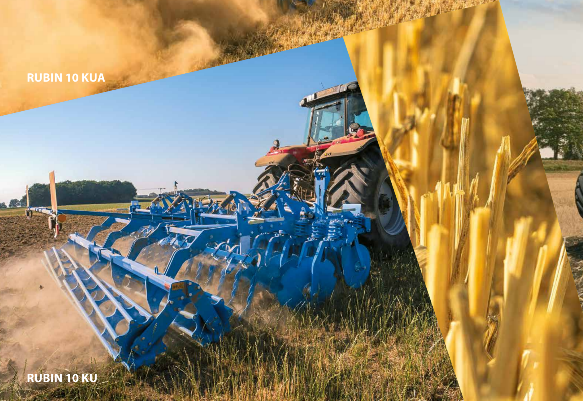
RUBIN 10 KU