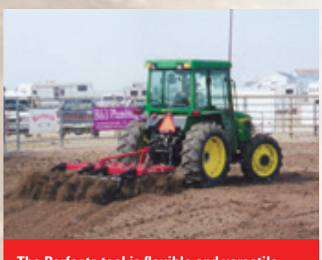
The Perfecta tool is flexible and versatile. It's perfect for track and arena grooming.

The bedded-crop model of the Perfecta field cultivator is the ideal implement for finishing beds before planting. While uprooting growing weeds to wilt and die, the Perfecta is also loosening and aerating the soil for optimum seed-to-soil or root-to-soil contact. Models are available for a variety of bed widths.