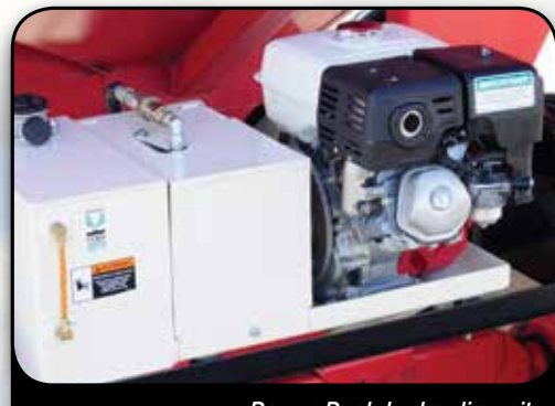
Power-Pack hydraulic unif