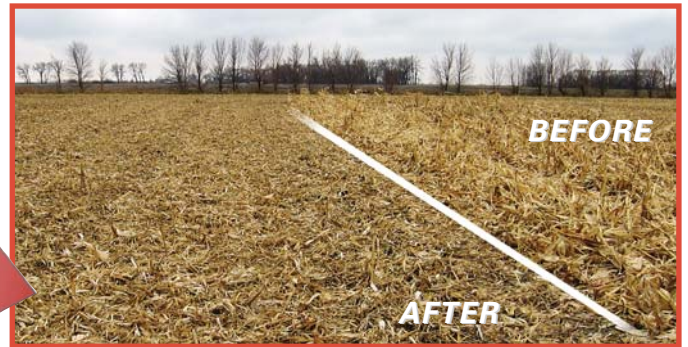
Excellent Shredding and Distribution