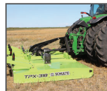
3pt Hitch Mount