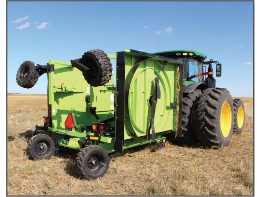
Narrow transport position with wide hinge gap allows material to fall through instead of on to center deck

Front tractor weight kits may be required to ensure a minimum of 20% of total tractor weight is on front tires to maintain steering control and to prevent the front of the tractor from rearing up during operation.