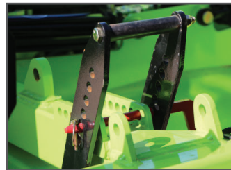
Deck Height Angle Adjustment