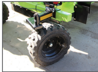
Rear Castor Wheels