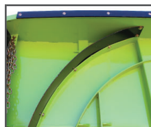
Fixed Knife Baffling