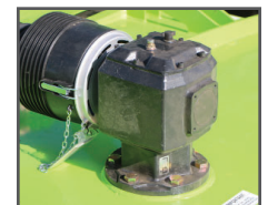
210hp (157kw) Gear Box