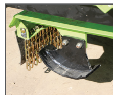
Replaceable Skid Shoes