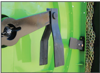
Fixed Knife and Safety Chains