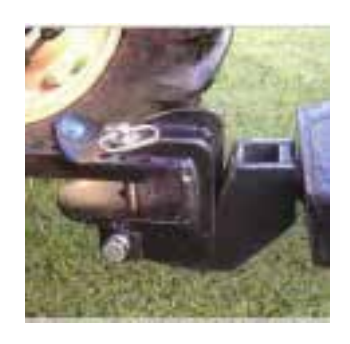
FLAT SWIVEL HITCH Greatly reduces drawbar wear