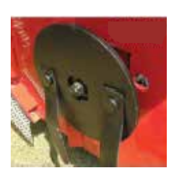
SOLID STEEL STUMP JUMPER Round - \frac{3}{4} " thick