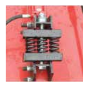
TRIPLE SPRING SHOCK ASSEMBLY (Tailwheel section)

GREASABLE WING HINGES (8 fittings per wing)