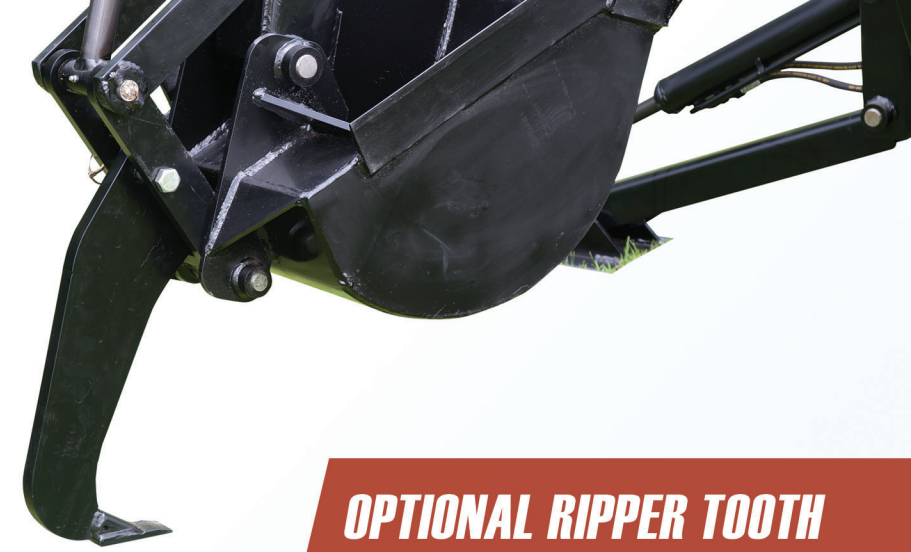
OPTIONAL RIPPER TOOTH