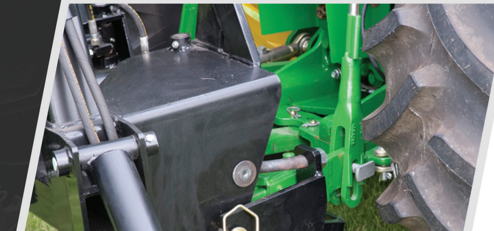
OPTIONAL HYDRAULIC SYSTEM